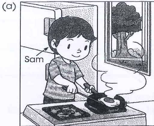
kitchen / stove / fry

You are Sam. You were making breakfast in the kitchen this morning. Based on the pictures below, write a diary entry about what happened in 110 words. Add adjectives, adverbs, dialogues and one simile/ idiom . You may use the words given.