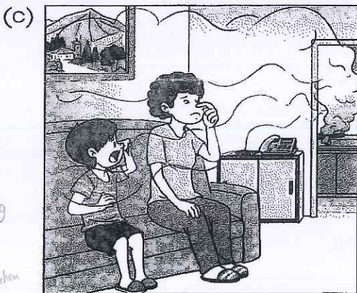
sitting room / smoke / burnt