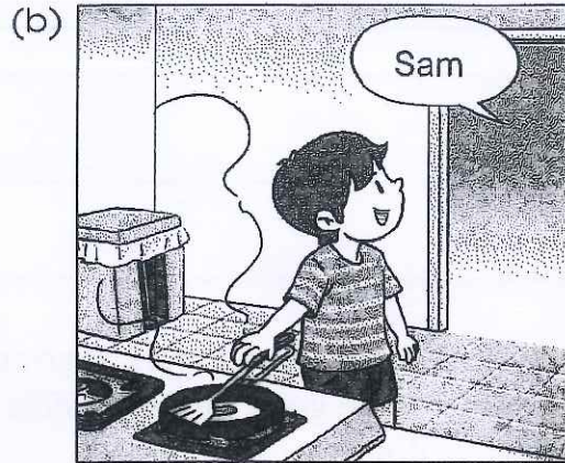
spatula call / put down